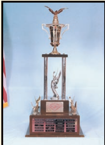
SIKORSKY AIRCRAFT UNITED TECHNOLOGIES CORPORATION