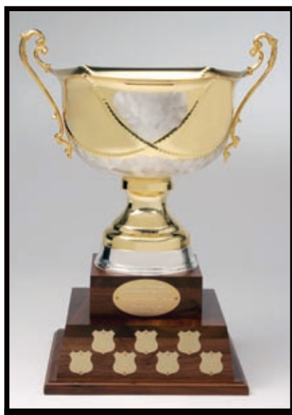
BELL BOEING TEAM

In Recognition of The Most Outstanding Tiltrotor Squadron in Marine Aviation.